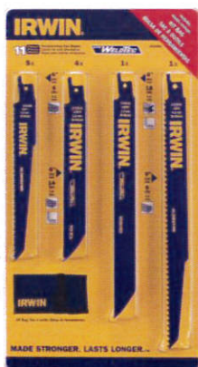
Recip Weldtec Saw Blade Kit with Bonus Pouch 11 Piece T4935496