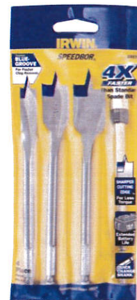
3 Piece Spade Bit Set with Quick Change Extension T88874ME