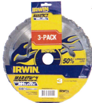
Weldtec Circular Saw Blade 24T/24T24T Set T94010WT3SB