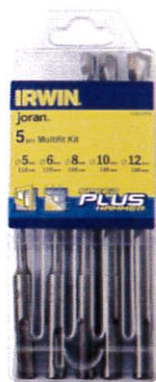
Speedhammer Plus Multi-Fit Drill Bit 5 Piece Set T105035PK