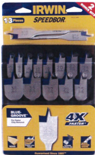
13pc Speedbor Blue Groove Set T3041011MEB